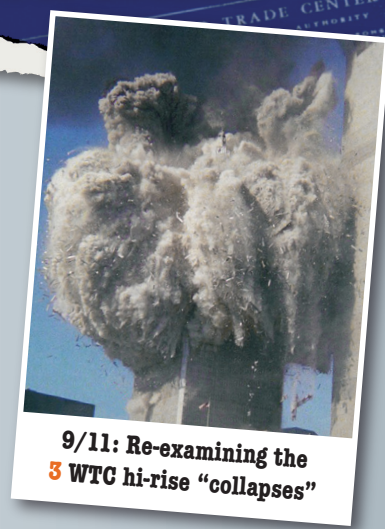
9/11: Re-examining the 3 WTC hi-rise "collapses"